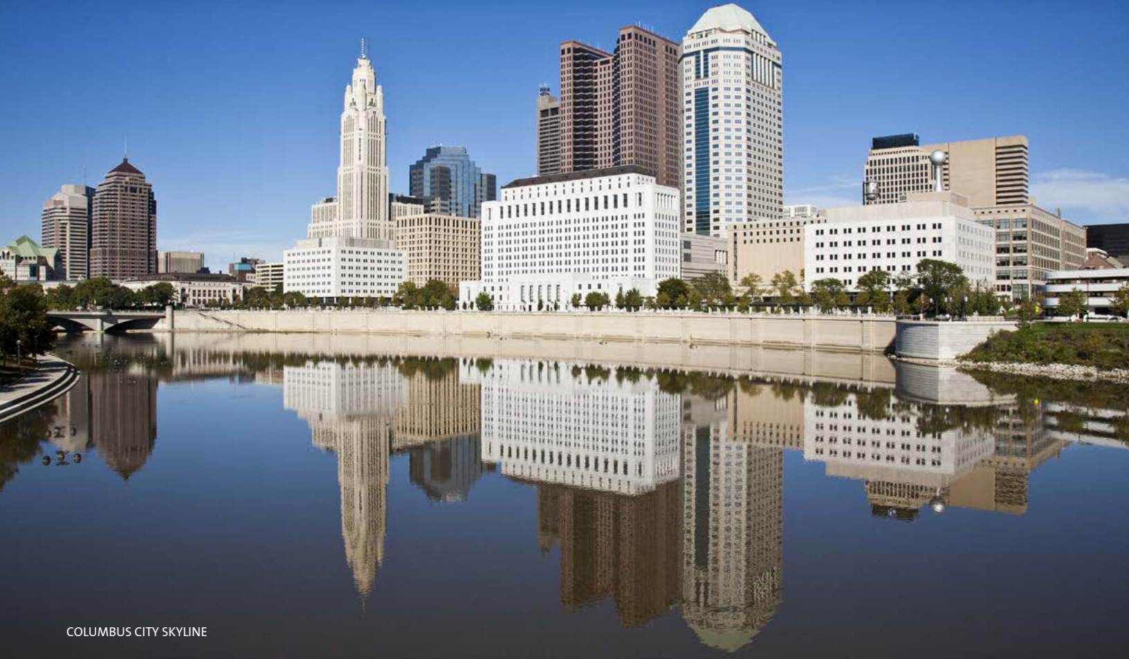
COLUMBUS CITY SKYLINE